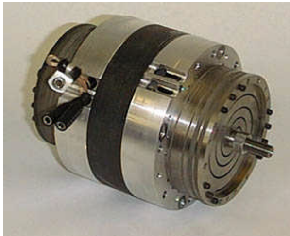
Balance motor for 350-We converters.

from a vibration signal and will cancel the fundamental vibration and up to 10 harmonics. A balance mass is driven by a separate linear motor; only one balance motor is needed for two opposed Stirling converters. A balance motor being used in the first AVRS testing is shown in the following photo. A fast Fourier transform of the vibration signal is used to construct a compensation signal that is sent to the balance motor through a power amplifier. Both the amplitude and phase of each harmonic can be adjusted. Converter frequency must also be measured on a continual basis and factored into the control algorithm. The AVRS will adjust to any change in converter operating conditions, any converter degradation that may occur over a mission, and even to a converter failure, in the unlikely event that one occurs. The AVRS will first be demonstrated on two 350-We RG-350 converters and then on the DOE/STC 55-We converters being developed for the radioisotope power system.