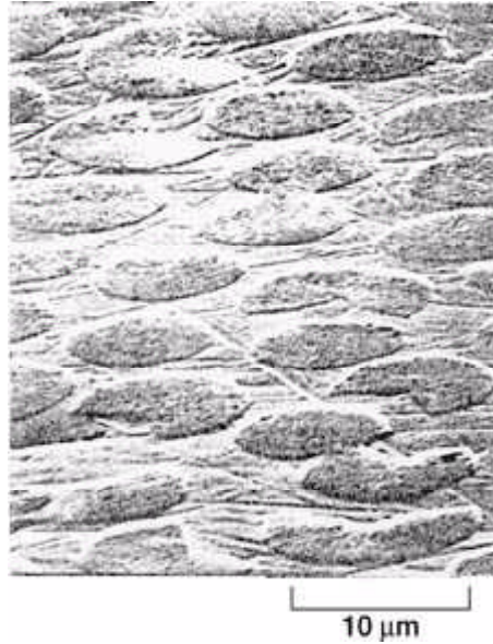
Cu-Gr composite surface.

The current experiment was conceived by Dr. Nengli Zhang of the Ohio Aerospace Institute. Experimental studies were conducted of the nucleate boiling heat transfer of pentane on metal-graphite composite surfaces with a fiber volume concentration of 50 vol %, including copper-graphite (Cu-Gr) and aluminum-graphite (Al-Gr) composite surfaces. The nucleate boiling heat transfer performance of metal-graphite surfaces is obviously much better than that of pure metal surfaces, as shown in the graph. In this figure, superheat \Delta T is equal to the difference between the wall temperature and the saturation temperature of the working fluid (here, pentane), and q is heat flux transferred from the wall to the working fluid. On the basis of the experimental results and according to the two-tier configuration and mathematical model proposed by Zhang et al. (ref. 2), a correlation for the heat transfer performance in the nucleate boiling regime was derived.