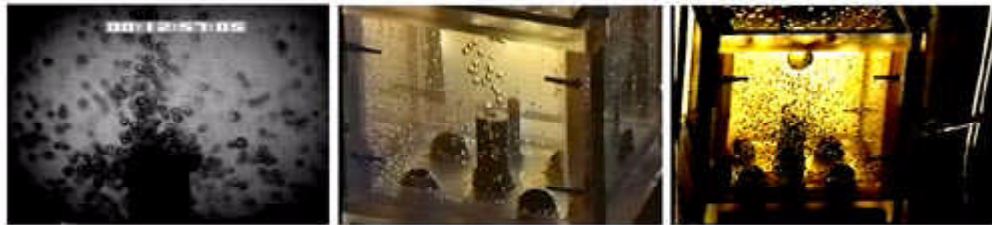
Spinning bubbler concept. Left: Two-dimensional side view. Center and right: Three-dimensional views.

Generation of bubbly suspensions of uniform bubble diameter (standard deviation <10 percent) in space is a difficult task because bubbles do not detach as easily as on Earth. Under microgravity, the buoyancy force is not present to detach the bubbles as they are formed from nozzles. One way to detach the bubbles is to apply an external force on them. As suggested by Kim et al. (ref. 1), the drag force produced by a liquid flowing in a cross-flow or co-flow configuration with respect to the nozzle direction will detach the bubbles as they are being formed.