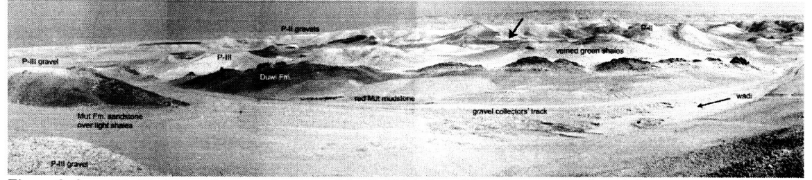
Figure 3. from [1]. West to east composite view of the Dakhleh Bow Wave Structure 'upthrust' feature, as seen from the P-III limestone gravel-capped ridge to the south. Note circular aspect within the veined green shales inside the upthrust (black arrow), which is picked-out by morning light, suggesting that the feature is an eroded impact crater.

Acknowledgements: Part of the research described in this paper was carried out by the Jet Propulsion Laboratory, California Institute of Technology, under a contract with the National Aeronautics and Space Administration. We wish to heartily thank the Dakhleh Oasis Project for its encouragement of this work.