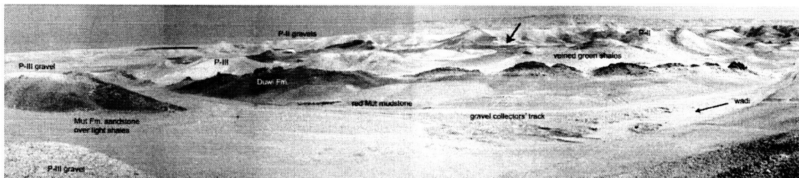
Figure 3. from [1]. West to east composite view of the Dakhleh Bow Wave Structure 'upthrust' feature, as seen from the P-III limestone gravel-capped ridge to the south. Note circular aspect within the veined green shales inside the upthrust (black arrow), which is picked-out by morning light, suggesting that the feature is an eroded impact crater.

Acknowledgements: Part of the research described in this paper was carried out by the Jet Propulsion Laboratory, California Institute of Technology, under a contract with the National Aeronautics and Space Administration. We wish to heartily thank the Dakhleh Oasis Project for its encouragement of this work.