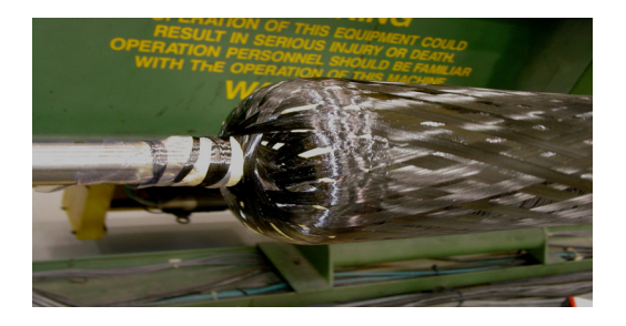
Figure 5: Wet winding of carbon fibers

In the third project, the carbon fibers were wet wound onto the tank first. The epoxy resin was allowed to cure. A layer of felt was wrapped over the cured carbon fibers of one tank. This was done so that one impact test could be performed with the felt and one without it. This will determine if the felt aids in impact reduction. The braided structure was applied over this layer of felt. The braided structure was applied directly on top of the cured carbon fiber for the other tank. A second layer of carbon fibers was wet wound on top of the braided structure for both tanks. The epoxy resin was allowed to cure.