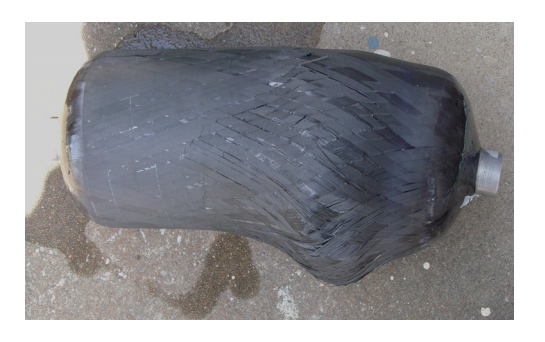
Figure 8: Tank w/ carbon and resin fails at 7800 psi