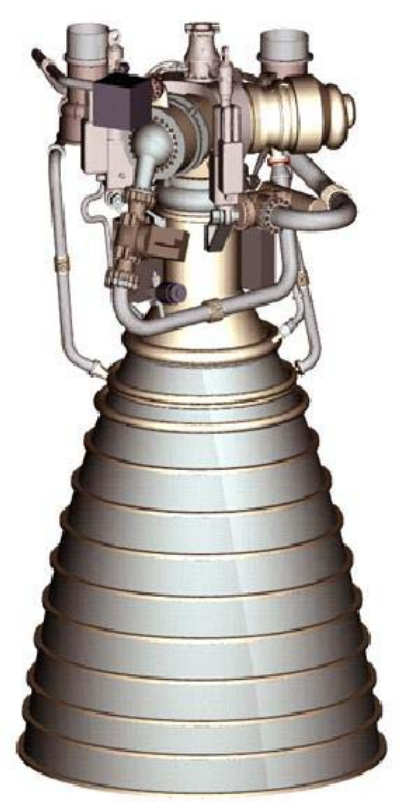
Figure 2: COBRA

The COBRA engine system was selected for development under the Cycle-1 of the NRA8-30