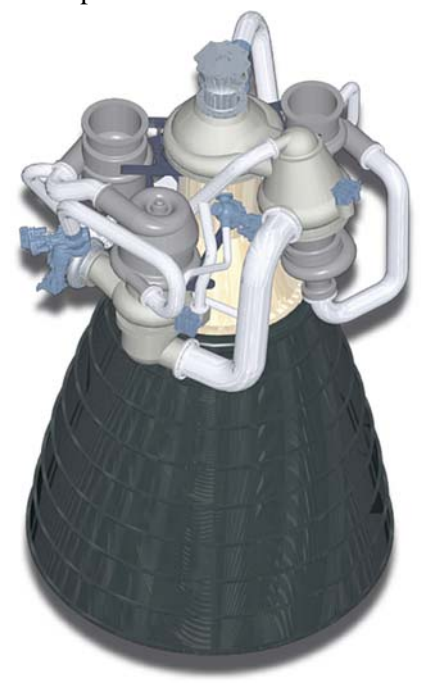
Figure 3: RS-83

parallel configuration used by the COBRA system. The RS-83 is a clean sheet design built on experience gained from the lengthy history of producing the SSME. Its development relies on advanced integration design tools and more rigorous design optimization in a quicker design cycle. Risk reduction activities have included the development of advanced fabrication processes that result in more consistent material properties and shorter production times. The RS-83 is