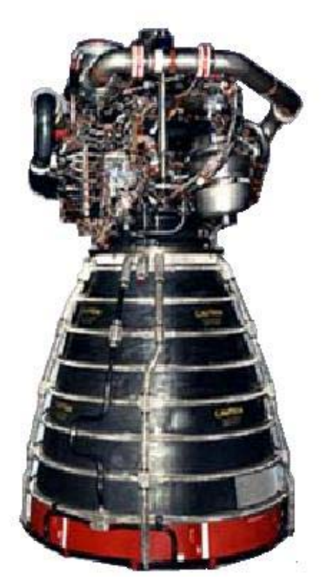
Figure 1: SSME

Under Cycle-1 of the 2GRLV program, two prototype LOX/LH2 main engines were selected for development to reduce technical risks: the COBRA engine by the Joint Venture (JV) of Pratt & Whitney (P&W) and Aerojet, and the RS-83 by Rocketdyne.