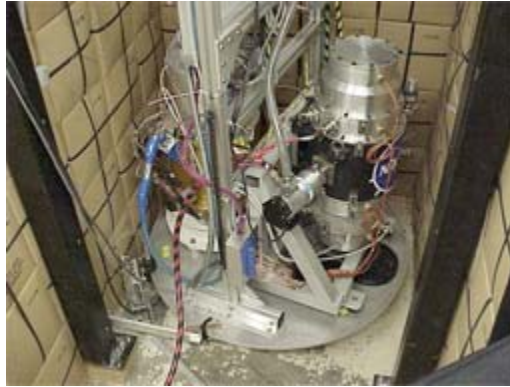
Test hardware for Integrated Power and Attitude Control System..

On September 14, 2004, NASA Glenn Research Center's Flywheel Development Team experimentally demonstrated a full-power, high-speed, two-flywheel system, simultaneously regulating a power bus and providing a commanded output torque. Operation- and power-mode transitions were demonstrated up to 2000 W in charge and 1100 W in discharge, while the output torque was simultaneously regulated between \pm 0.8 N-m.