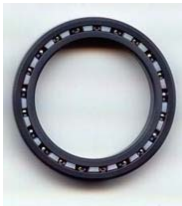
Nitinol rolling-element bearing assembly.

The development of commercial applications of nitinol is continuing. For example, nitinol has found application as the race in rolling-element bearing assemblies (see the following photograph). To meet the more stringent thrust-to-weight goals of today's high-performance engines, rolling-element bearings must operate at speeds exceeding 2.4 million DN (the product of the inner race bore in millimeters and the speed in revolutions per minute) and at temperatures up to 478 K using lubricating oil or grease. This temperature limit is imposed primarily by the lubricant (ref. 3). Fatigue is considered to be the life-limiting factor for these bearings, although fewer than 10 percent of the failures are fatigue related. Most failures are due to the lubricant, such as lubricant starvation, contamination, and deterioration (ref. 3). In addition, there are significant adhesion, friction, and wear issues that affect the performance and lifetime of the bearing assembly. The promising results of friction and wear properties obtained in this investigation may fit design needs for high-temperature applications because oxide films may be preferred to oil or grease lubrication. At temperatures above 478 K, oil and grease decompose. Nitinol with oxide surfaces can extend operating temperatures while maintaining low friction and high wear resistance.