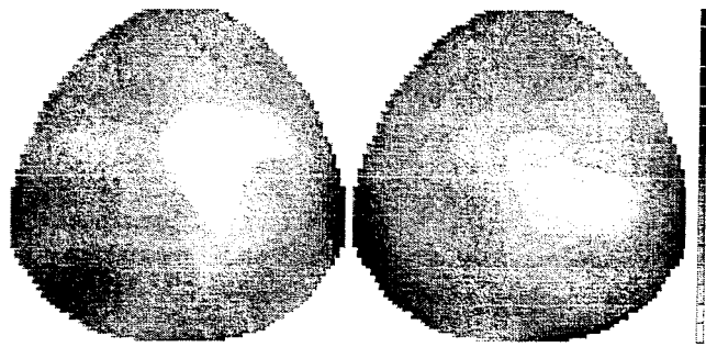
Figure 2. Topographic scalp projections of the first PLS weight vector at the time point 370ms after the onset of movement. Left : day 1 data. Right : day 2 data.