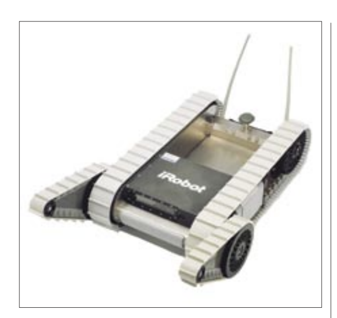
Already proven in Afghanistan and Iraq, the PackBot Scout is the ideal "point man" to search dangerous or inaccessible areas, providing soldiers with a safe first look so they know what to expect and how to respond.

"PackBot is as tough, if not tougher, than any piece of military equipment I have ever used," according to one U.S. colonel stationed in Afghanistan.