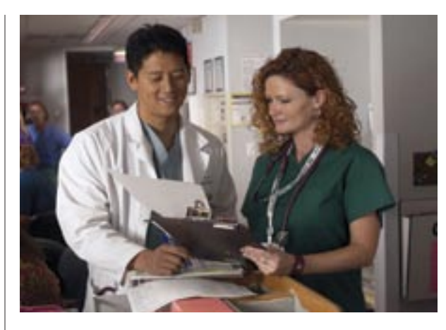
The Lucidoc system is working to help medical professionals in California get the information they need when they need it.

Community banks and credit unions are regulated by their state governments, the Federal Government, and groups such as the U.S. Securities and Exchange Commission, Fair Housing Regulators, and insurers. These financial institutions risk hefty civil and criminal penalties for compliance failures. Banks must be able to