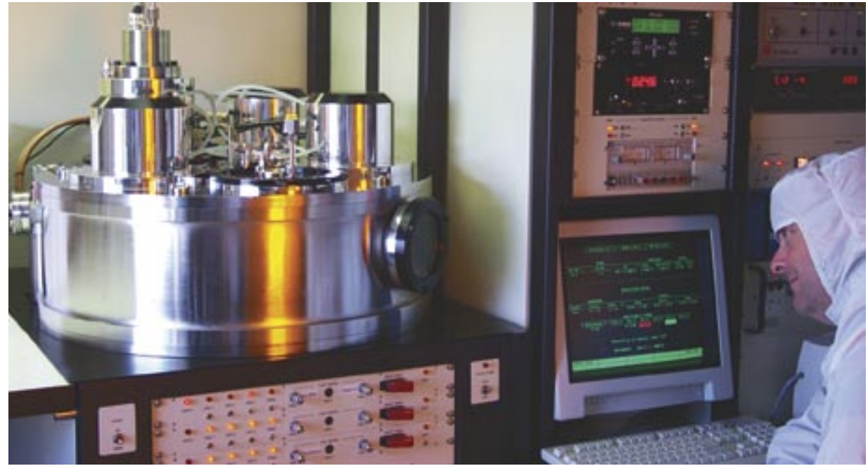
A process engineer depositing thin films used to fabricate SQUID devices.

pcSQUID™ is a trademark of STAR Cryoelectronics, LLC. Microsoft® and Windows® are registered trademarks of Microsoft Corporation.