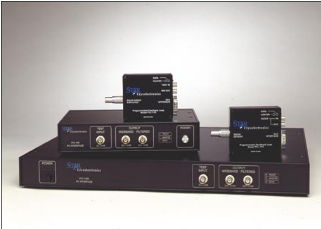
STAR Cryoelectronics, LLC's line of single- and multi-channel PC-based readout electronics for SQUIDs and SQUID amplifiers.

The PC-based SQUID control-electronics that STARCryo manufactures are marketed under the trade name pcSQUID and offer unsurpassed flexibility and performance for single- and multi-channel applications, in addition to being convenient and easy to use. A convenient interface for Microsoft Windows puts the SQUID control on the computer, fully integrated with data acquisition and analysis tools.