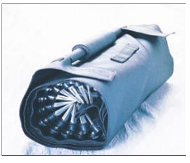
The "wrap and roll" MagnumSpike! model, packed in a soft ballistic nylon case, is 12 feet in length, weighs 9 pounds, and contains 160 spikes.

"We have used the MagnumSpike! at least 30 times with complete success in ending the pursuit without injuries or cars getting damaged," said Gary Miller, sheriff of Wright County, Minnesota. "From our testing and experience, I can say the MagnumSpike! is the best. It does the job every time, regardless of vehicle size," he added.