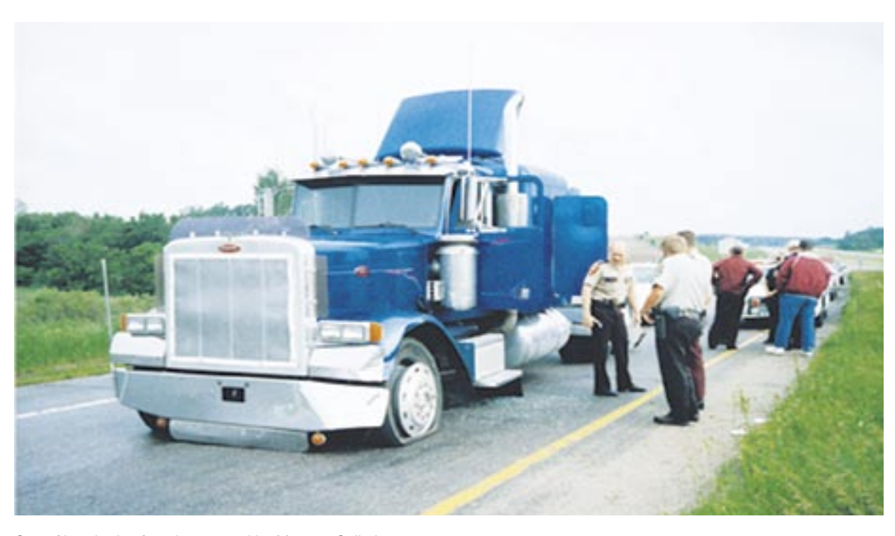
One of hundreds of trucks stopped by MagnumSpike!

development and initial manufacturing of a new vehicle stopping product called the StaticStop, which consists of a disposable spiked wheel chuck that can be used to detain vehicles in routine traffic stops.