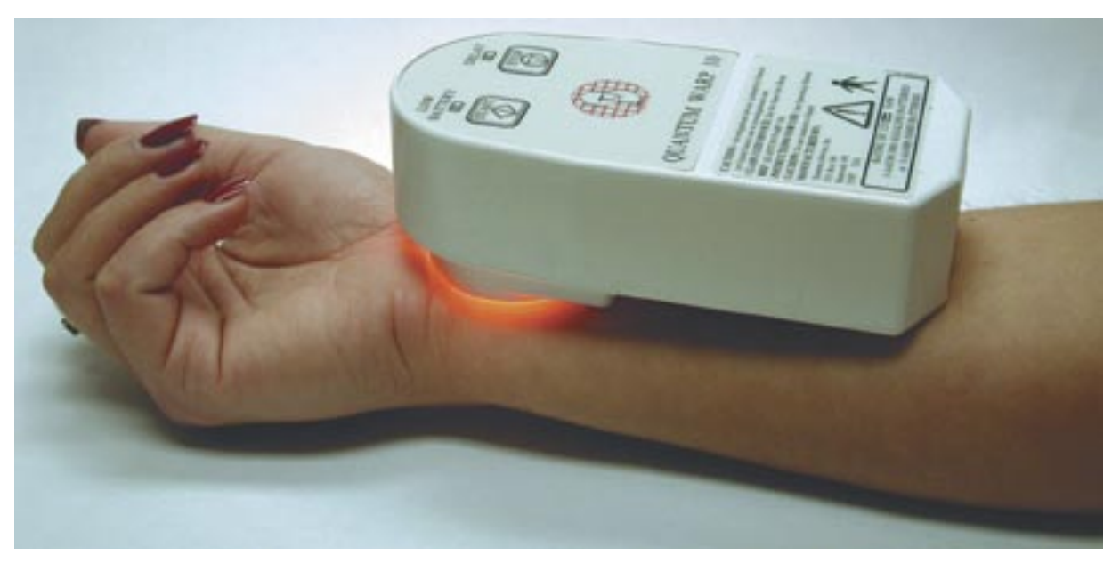
The WARP 10 was designed to assist armed forces personnel with immediate first aid and care for minor injuries and pain. A consumer version is also available.

The positive clinical trial results, as well as continued support from NASA and follow-on research grants from the Defense Advanced Research Projects Agency, helped QDI and the Medical College of Wisconsin to fully transition space technology into a new, noninvasive medical device. The WARP 10 (Warfighter Accelerated Recovery by Photobiomodulation) is a high-intensity, hand-held, portable LED unit intended for the temporary relief of minor muscle and joint pain, arthritis, stiffness, and muscle spasms. It also promotes relaxation of muscle tissue and increases local blood circulation. Unlike the surgical probe, the WARP 10 does not require intravenous medicine; instead, the unit