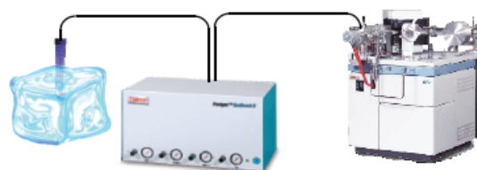
Figure 1. A cartoon of the experimental setup with a cooled vial containing the solution on the left, the Gas Bench II in the middle and the MAT 253 IRMS on the right.

Methods: The method described here utilizes our new MAT 253 Isotope Ratio Mass Spectrometer installed at Johnson Space Center during the Fall of 2006. By running this instrument in continuous flow mode, we sample the headspace gas above a freezing solution continuously until the solution has completely frozen and CO 2 levels have dropped below our measurement threshold (Fig. 1).