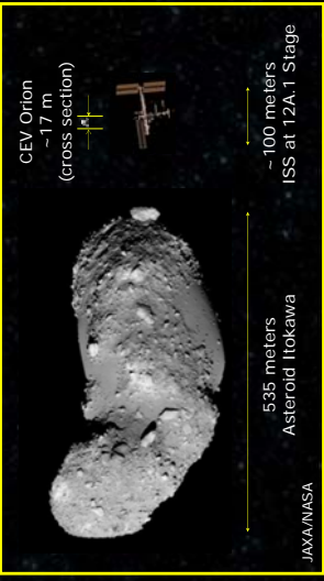
Fig. 1: Asteroid Itokawa, International Space Station, and CEV shown to scale.