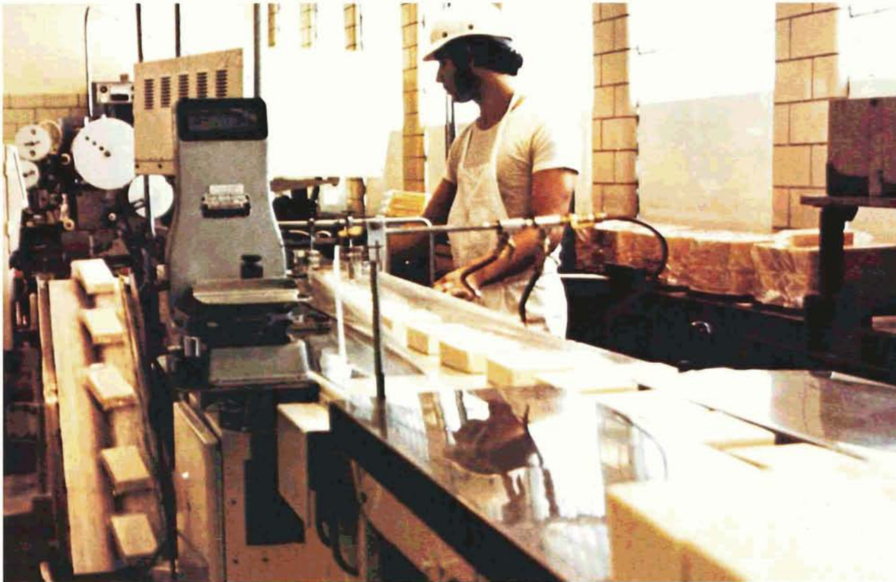
The photo selection shows representative member farms and some of the ancillary and production equipment employed at the four plants, which are located in Manitowoc, Sheboygan, Kiel and Denmark, Wisconsin.