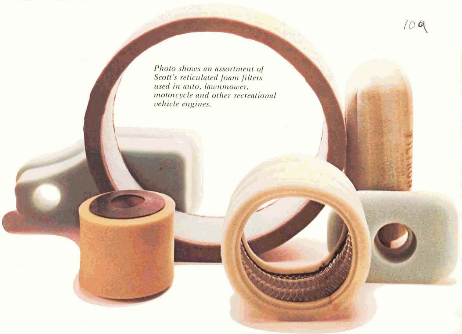
Photo shows an assortment of Scott's reticulated foam filters used in auto, lawnmower, motorcycle and other recreational vehicle engines.