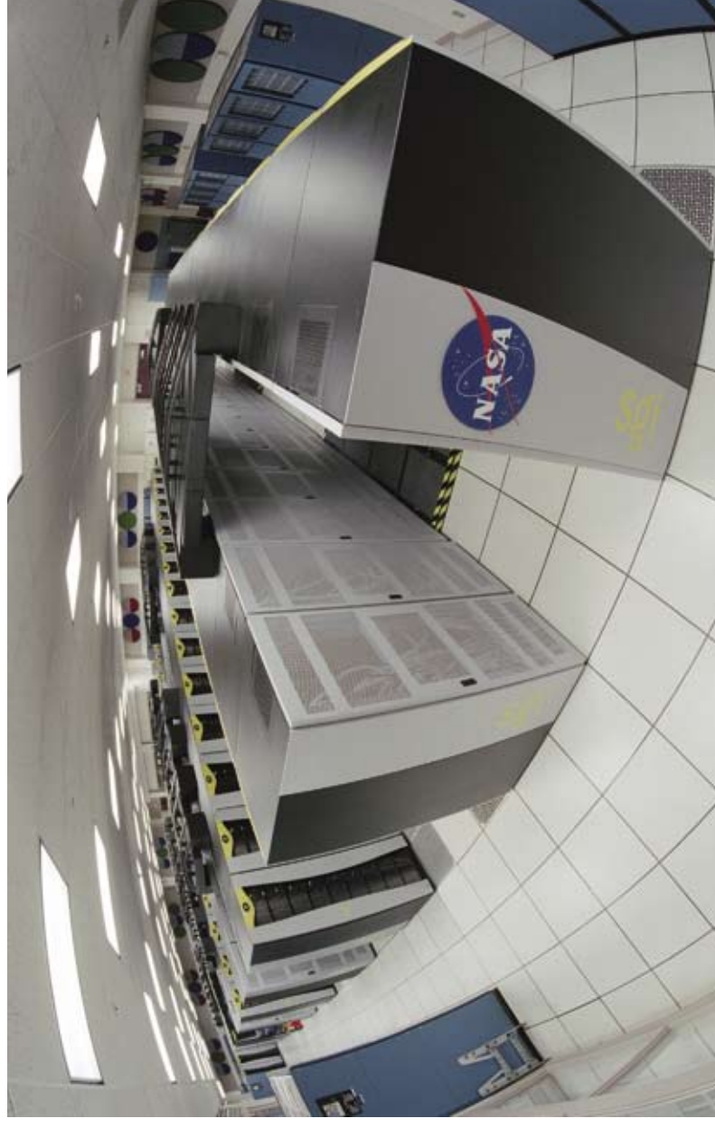
A bird's-eye view of the 10,240-processor SGI Altix "Columbia" supercomputer located at Ames Research Center. While Columbia is helping NASA achieve breakthroughs and solve complex problems in support of its missions, it has also been made available to a broader national science and engineering community.