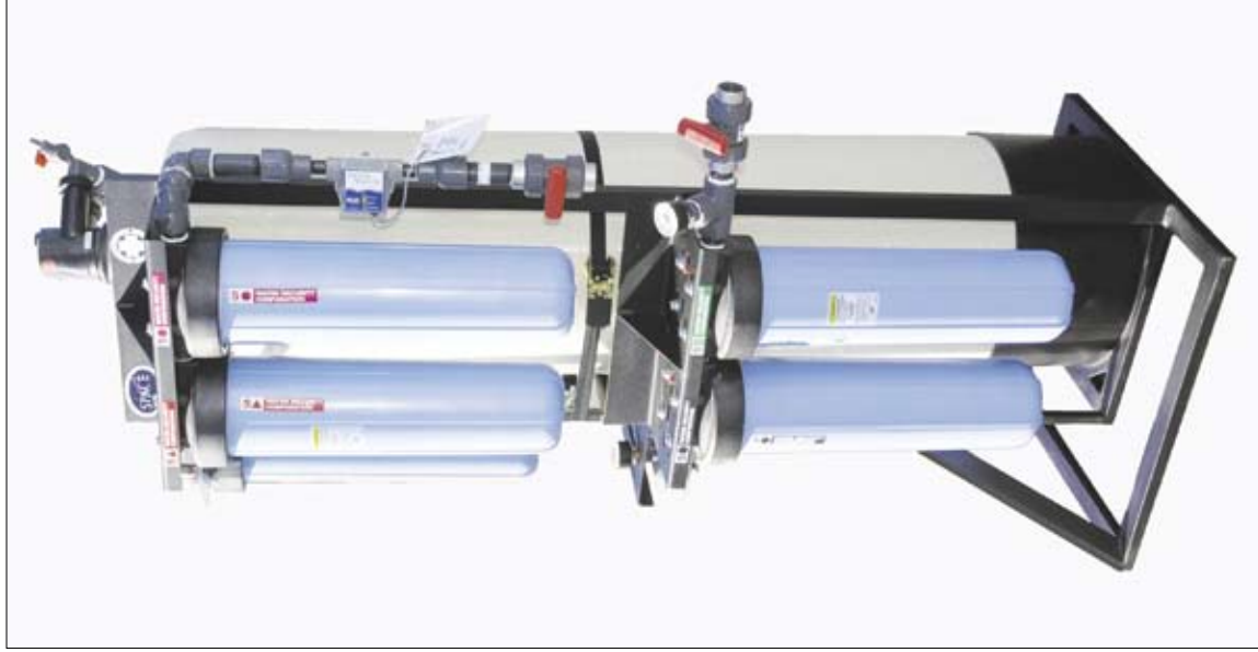
The Discovery — Model WSC4 unit pictured here has been deployed to rural areas around the world to assist in providing people with clean, drinkable water.

The United Nations estimates that 1 billion people lack access to safe drinking water, 10 million people die each year of waterborne diseases, and 2 million of those deaths are children. The major sources of this contaminated water are bacteria, viruses, and cysts. These pathogenic