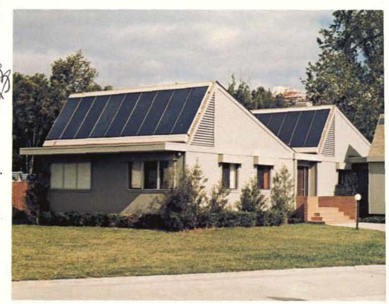
Tech House, located at NASA's Langley Research Center, Hampton, Virginia, is a demonstration project in which aerospace and commercial building technology are combined to produce an energy-efficient home. Advanced technology offers savings to the family in utility costs and energy conservation.

The principal energy-saving comes from using the sun's rays to heat the home and provide domestic hot water. Sunlight is captured by 19 solar collectors on the roof. These south-facing collectors are angled