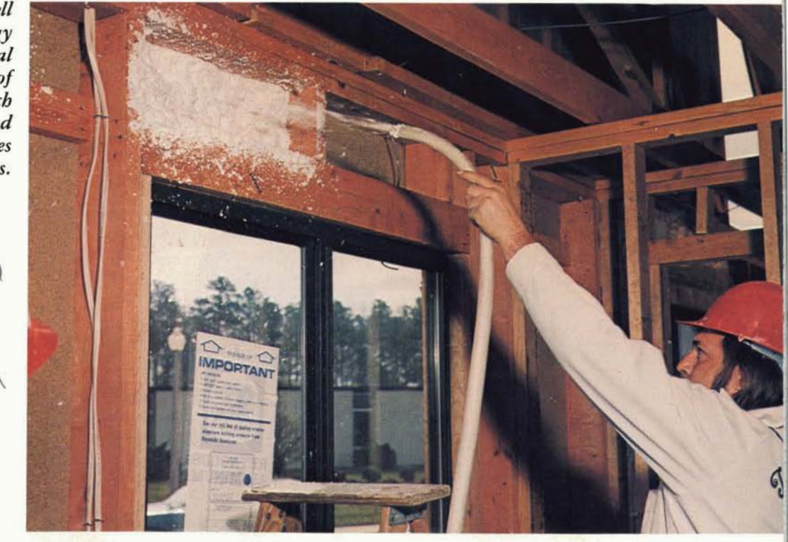
Tech House is well insulated for energy savings. The principal insulation is fireproof Tripolymer foam which is sprayed onto walls and ceilings in thicknesses up to six inches.

The system is largely independent of electrical energy, although an electric heat pump is also employed to transfer heat from the storage tank to the living space of the house.