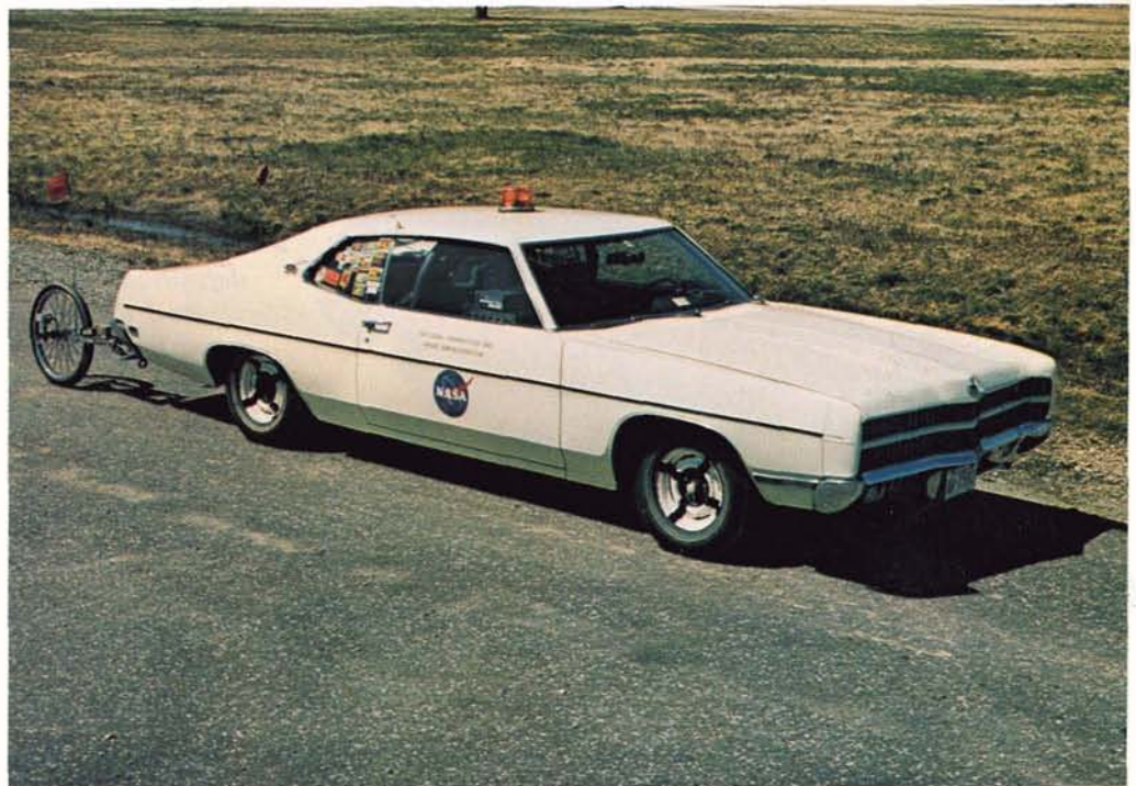
A NASA-developed five-wheeled vehicle serves as a mobile laboratory for testing roadway skid resistance. It does a job comparable to more expensive test vehicles, but at a fraction of the cost. Cost is a big factor to many communities, which need skid resistance data for improving road surfaces but can't afford highly expensive skid trailers and their elaborate instrumentation.