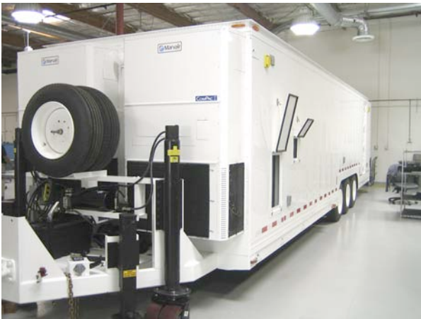
Figure 2. An outside view of the Ikhana ground control station.

These systems will be available to conduct missions in support of the international science community and for sensor development and characterization, including collision avoidance work.