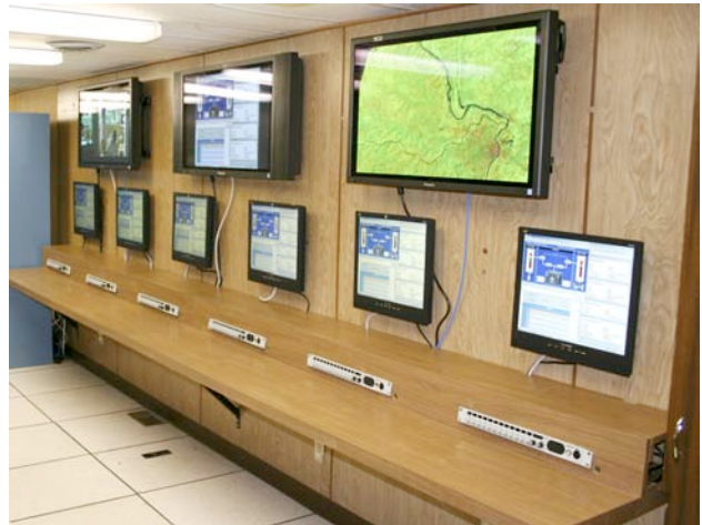
Figure 3. An inside view of the Ikhana ground control station.

and high-performance fighter jets), the ER-2 (Lockheed Martin Corporation, Bethesda, Maryland) airplane, ground facilities that include a small UAS fabrication shop with the ability to fabricate one of a kind airframes, environmental test chambers, and simulators.