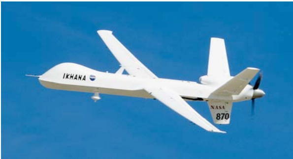
Figure 1. The NASA UAV, Ikhana.

The air vehicle and payload command and control communications streams will be independent to ensure inherent vehicle integrity while allowing for the widest possible payload opportunities. An experimenter's interface handbook, containing payload integration and environmental requirements will be available for payload developers.