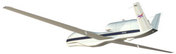
Figure 4. Artist's rendering of the NASA Global Hawk.