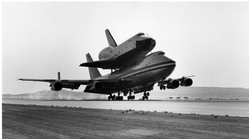
Figure 1. Shuttle Carrier Aircraft and orbiter in mated configuration.

A Boeing 747 was modified as a Shuttle Carrier Aircraft (SCA) to carry Enterprise to altitude for the captive and free-flight tests (Fig. 1). Most of the passenger accommodations were removed and parts of the fuselage underwent structural reinforcement to support the weight of the orbiter. Tip fins were added to the horizontal stabilizers. An emergency escape system slideway was provided for the 747 crew (OV-101 was equipped with ejection seats) along with pyrotechnics to open an escape hatch in the side of the fuselage. Support struts (two aft and one forward) were installed atop the 747's fuselage to hold the orbiter. At the beginning of each free-flight, explosive bolts released the orbiter from the SCA.