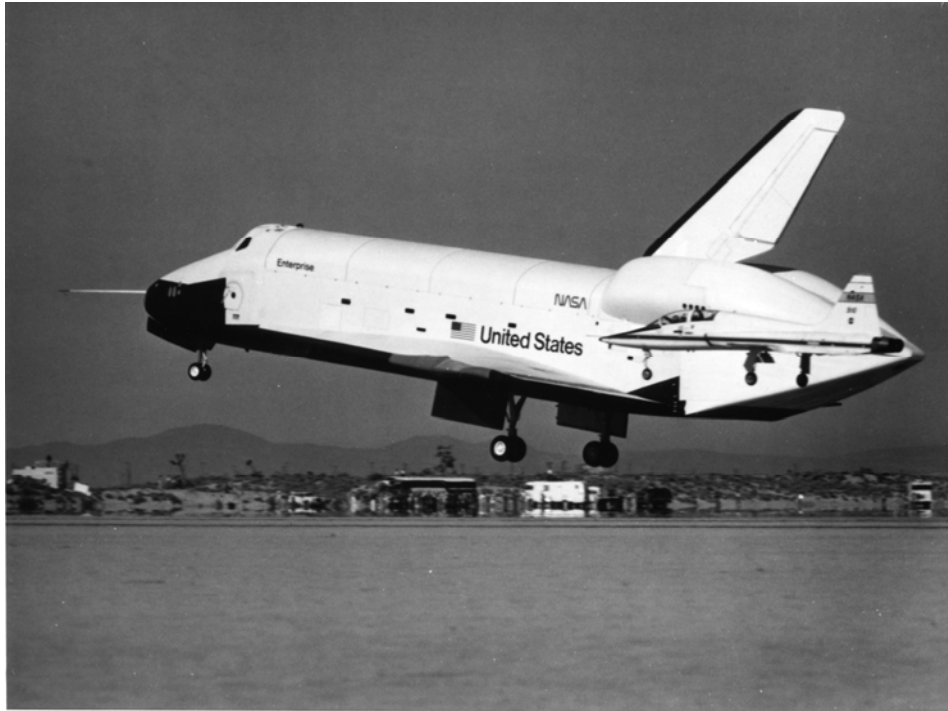
Figure 6. The orbiter, accompanied by a chase plane, just prior to touchdown on the lakebed runway.

Separation for Free Flight 2 (FF-2), piloted by Engle and Truly (the crews alternated for each flight), occurred at an airspeed of 270 KEAS and an altitude of 23,200 feet. The crew performed a 1.8-g wind-up turn of about 135 deg and another 45 deg left turn. They completed various programmed stick inputs for flight control system and structural evaluation. Following five minutes and 31 sec of free flight, Enterprise touched down on runway 15 (Fig. 6). The landing point was 680 ft beyond the predicted touchdown and rollout was 10,037 feet. During heavy, moderate, and differential brake application a “chattering” phenomenon was experienced as the natural frequency of the gear struts resonated with the anti-skid control gains.