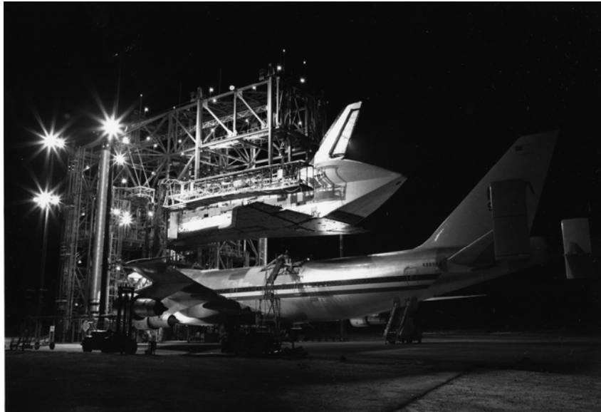
Figure 2. The orbiter is lowered onto the SCA in the Mate/Demate Device.