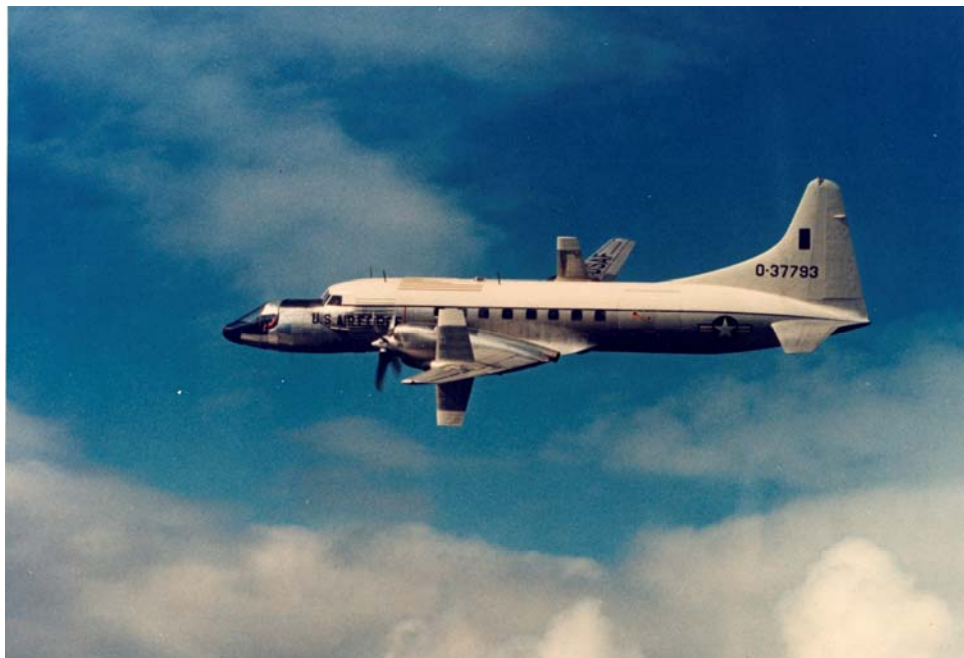
Figure 11. NC-131H Total In-Flight Simulator.