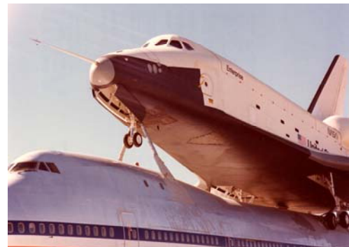
Figure 3. The orbiter's landing gear was lowered during the final captive-active flight.

In the captive-active phase the orbiter was powered up and manned while mated to the SCA. In consideration of the crew's safety, provisions were made for separation of the orbiter in the event of emergency. Three flights were conducted, to verify the separation profile as well as orbiter stability and performance in the mated configuration with combined operation of the primary flight control system, auxiliary power units, hydraulics and structure. Orbiter vertical-tail buffet data obtained during speed brake and rudder operation at 180 kn indicated no significant adverse oscillations. Flutter clearance tests, performed during the second flight at speeds up to 270 kn, revealed no sustained vibrations. The orbiter's dynamic response to rapid control inputs from both the orbiter and SCA was highly damped and considered satisfactory. Tail buffet was measured at incremental speed brake settings and various rudder deflections resulting in structural responses that were well within limits. An autoland fly-through allowed the orbiter crew to verify that the attitude indicator and horizontal situation indicator displayed accurate indications. The landing gear was lowered to verify that it functioned properly (Fig. 3).