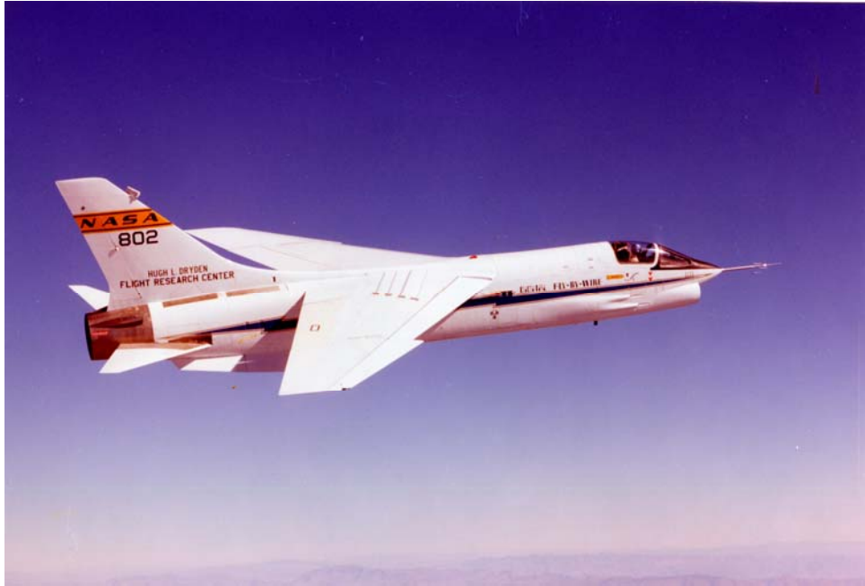
Figure 10. F-8 Digital Fly-By-Wire testbed.