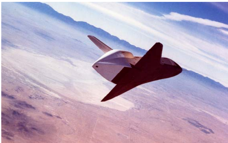
Figure 5. The orbiter approaches the lakebed landing site.