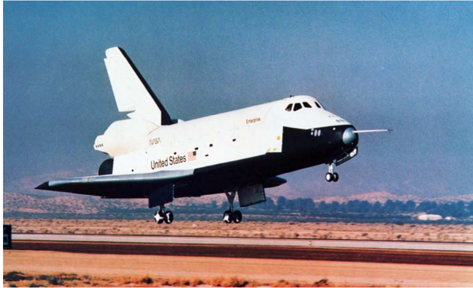
Figure 8. The final free-flight ended with a landing on the concrete main runway at Edwards.