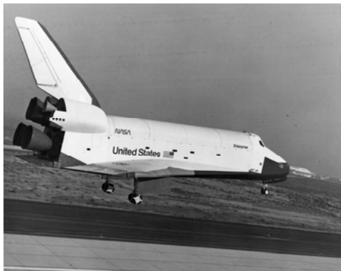
Figure 9. Enterprise approaches the concrete runway as the crew adjusts the approach attitude.

As Enterprise approached the Edwards main runway (Fig. 9), the pilot adjusted the vehicle's attitude in order to increase airspeed to 290 knots. Meanwhile the commander made left rudder and roll inputs prior to speed brake deployment to complete a set of aerodynamic data requirements. Enterprise intercepted the glideslope at 9,600 ft above ground level while the crew maintained alignment with the surface aim point and correlated instrument readings. In a smooth transition, as the orbiter dropped through 7,000 ft, the commander assumed control of the speed brake. When Enterprise was 4,000 ft above ground level, the crew noticed that they had drifted above the glideslope. To reacquire the aimpoint and prevent overspeed, the commander pitched the nose over and deployed speed brakes to 80 percent. He responded to a momentary 10-kn airspeed decrease by reducing speed brakes slightly. The pilot then noted an airspeed decrease to 275 kn followed by a rapid increase to 290 knots.