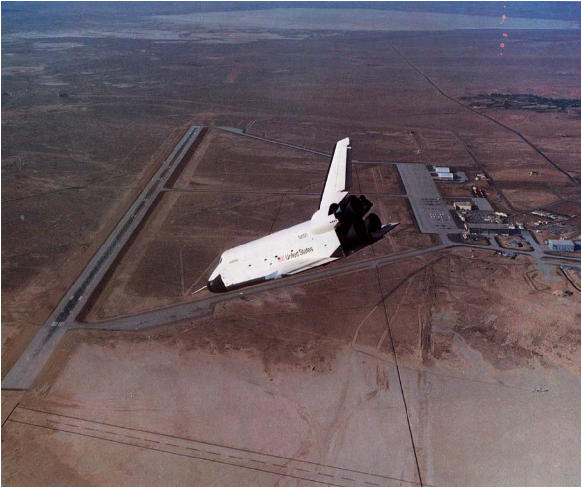
Figure 7. The orbiter during the first tailcone-off free-flight, with the Edwards main runway in the background.