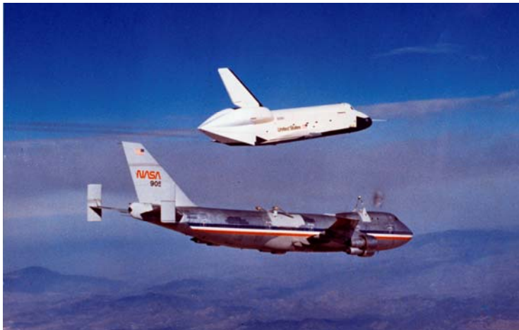
Figure 4. The orbiter separates from the SCA during the first free-flight.

The first free flight, on August 12, 1977, began with orbiter separation from the SCA at an altitude of about 22,800 ft above ground level at 270 knots equivalent airspeed (KEAS) (Fig. 4). Haise and Fullerton executed two 90 percent left turns during descent (Fig. 5) and landed on lakebed runway 17 five minutes and 22 seconds after separation. Touchdown was approximately a mile beyond the predicted landing point. The crew performed steering, braking, and coasting tests during the 11,000-ft rollout.