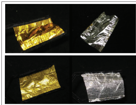
Figure 1. Digital Images of sample MLI debris. Top images are part of the space-facing layer and the bottom images are part of the space-craft facing layer. The A/M for these samples is ~ 10 m 2 /kg.

rise to interesting photometric light curves. In addition, filter photometry was conducted on the MLI pieces, a process that also will be used on the ESOC2 samples. While obtaining light curve data an anomalous drop in intensity was observed when the table revolved through the second 180 degree rotation. Investigation revealed that the robot's wrist rotation is not reliable past 80 degrees, thus the object may be at slightly different angles at the 180 degree transition. To limit this effect, the initial rotation position begins with the object's minimal surface area facing the camera.