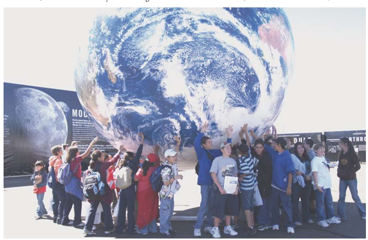
This 16-foot-diameter, pedestal-mounted, rotating globe was featured at the 2006 Wirefly X-Prize Cup in Las Cruces, New Mexico. This exposition of personal space flight is a "celebration of forward-looking technology, space exploration, and education," attracting thousands of people every October.

Years later, space shuttle astronauts are still finding the view of Earth from space a humbling and profound experience. Don Lind, astronaut aboard the STS-51B mission