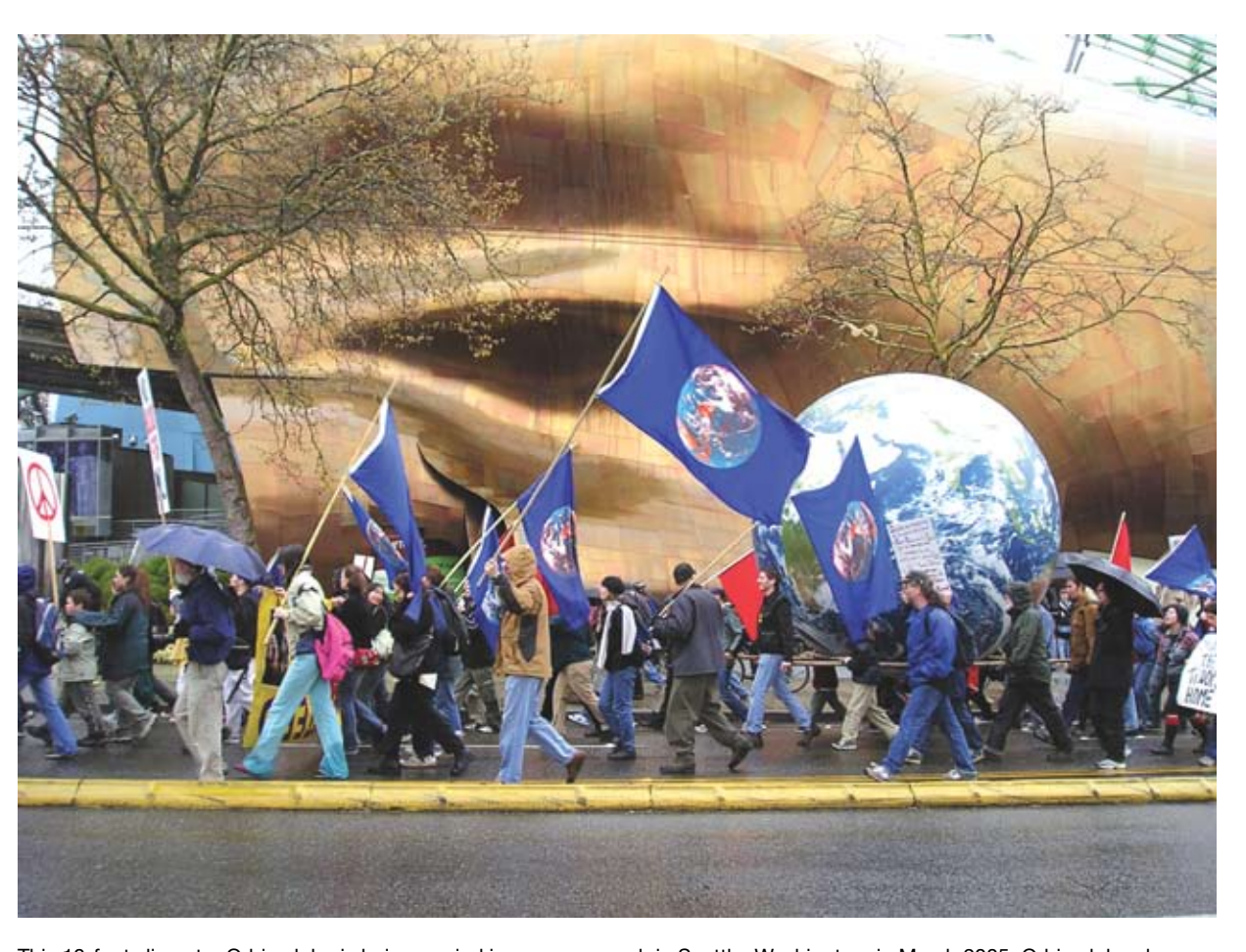
This 10-foot-diameter Orbis globe is being carried in a peace march in Seattle, Washington, in March 2005. Orbis globes have been a magnet for spectators and cameras in numerous parades, performances, and rallies around the world. (The gold building in the background is the Experience Music Project designed by renowned architect Frank Gehry.)

Orbis globes can be mounted on floor pedestals, suspended overhead, filled with helium and tethered