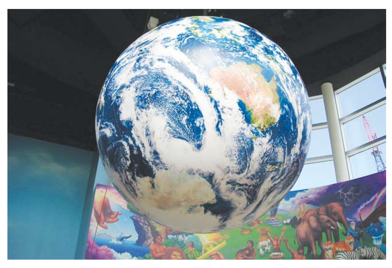
This 6-foot-diameter rotating Orbis globe is installed in the Children's Wing Atrium of Northland Church in Longwood, Florida.

NASA took notice of Orbis globes and employed a 16-inch-diameter EarthBall for an educational film it made aboard the STS-45 shuttle mission. "The Atmosphere Below," shot during the 9-day mission