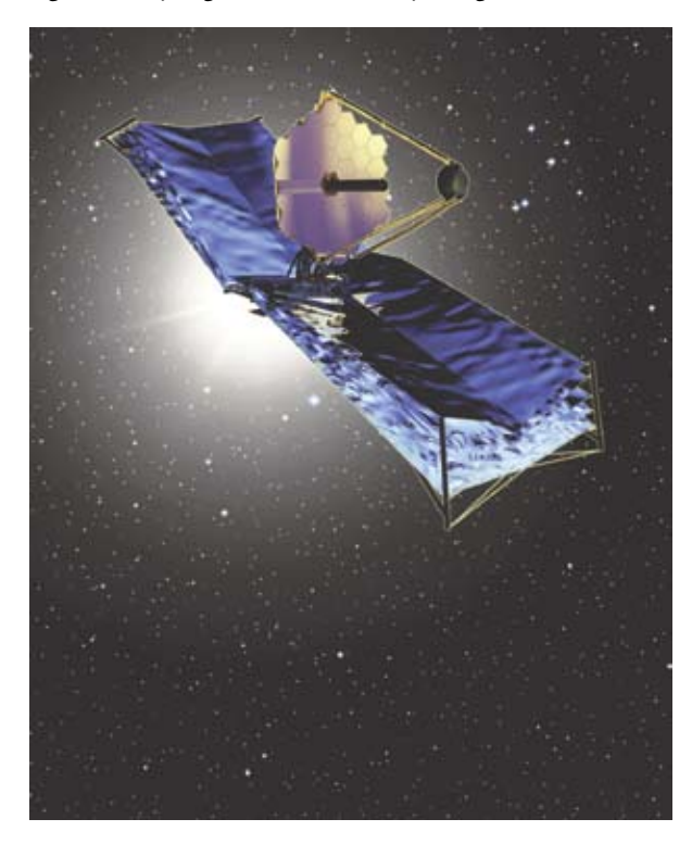
The James Webb Space Telescope is a large, infraredoptimized telescope, scheduled for launch in 2013. It will find the first galaxies that formed in the early universe, connecting the Big Bang theory to our own Milky Way galaxy.

The increased size of the structures reduces the dynamic frequencies of the optical system, to the point where disturbance frequencies and structural modes significantly interact. At the same time, the requirements on dynamic stability to achieve the required optical performance are significantly tighter than for anything that has flown