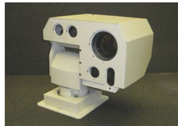
IEC Infrared Systems' Thermal/Visual Imaging Systems product line features a suite of thermal imaging devices that are used in a wide range of applications.

The firsthand NASA knowledge and the follow-up funding and technical support from the GATE award were the catalysts for IEC Infrared Systems to evolve from a start-up venture to a multimillion dollar business with a staff of more than 30 scientists, engineers, and technicians spanning a wide range of engineering fields. Today, the company offers two major thermal imaging solutions that stem directly from its vast NASA experience: NightStalkIR and IntrudIR Alert ("IR" for infrared). These two imaging systems have found widespread use