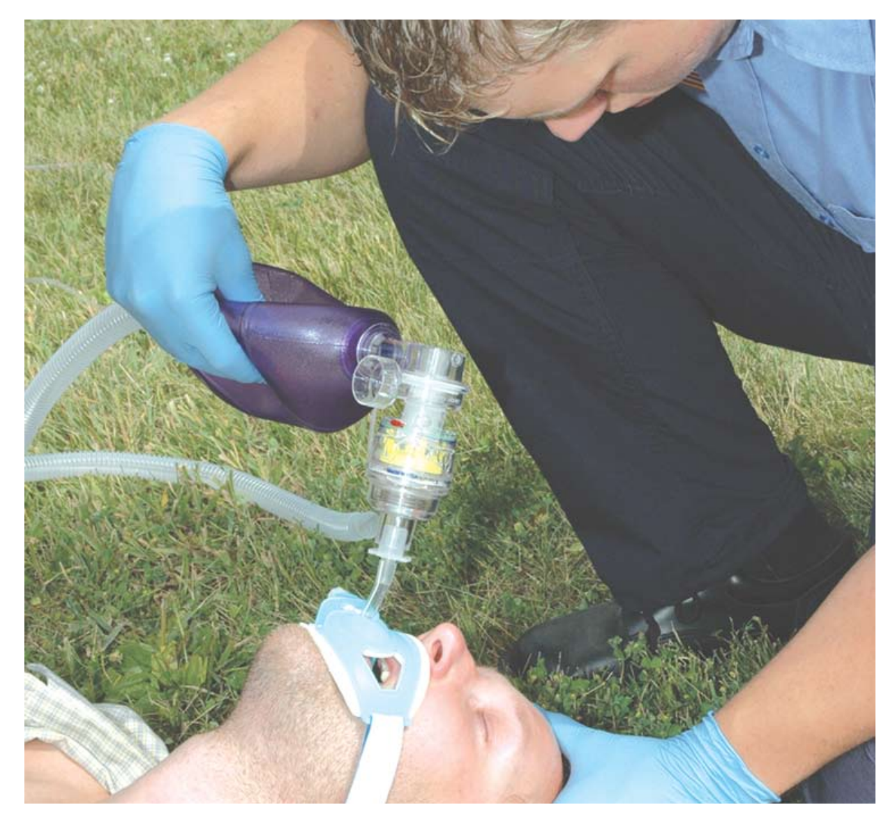
The ResQPOD increases circulation in states of low blood pressure. When used on patients in cardiac arrest, the ResQPOD harnesses the chest wall recoil after each compression to generate a small but critical vacuum within the chest. This vacuum enhances blood flow back to the heart and results in a marked increase in blood flow out of the heart with each subsequent chest compression.

Multiple clinical studies were conducted during the research effort, including six published studies. The published works demonstrate that ResQPOD offers a significant improvement in cardiac output and blood flow to the brain and in preventing shock in the event of considerable blood loss, when compared to conventional resuscitation. According to Advanced Circulatory Systems, data from the NASA studies played a major role in the company obtaining U.S. Food and Drug Administration 501K clearance for the device.