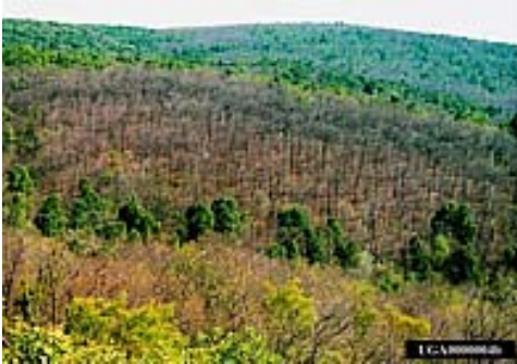
Denuded, Partially Denuded, Chlorotic, and Green Forest Vegetation