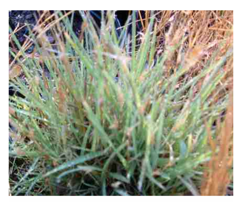
Figure 2.—Halophyte grass (Distichlis spicata), reference 24.

<sup>b</sup>Reference 21, <u>http://www.scielo.br/scielo.php?pid=S0103-</u> 90162005000300014&script=sci_arttext, soybean refined oil.