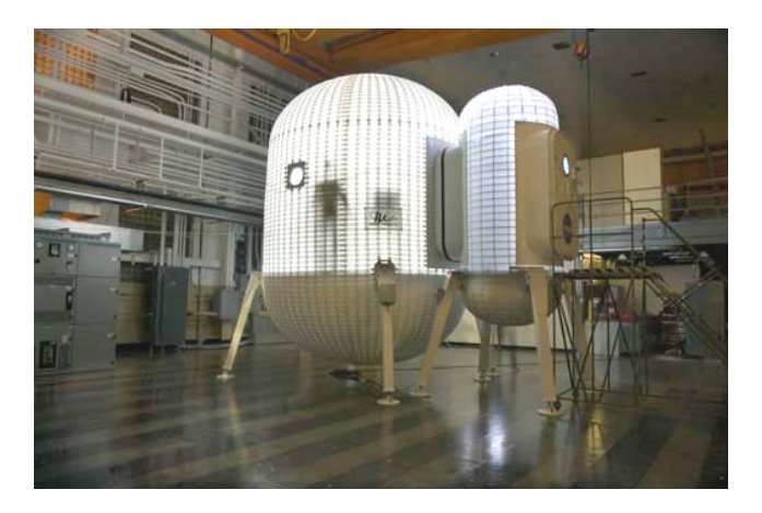
Figure 1. Model of inflatable lunar habitat concept.

The frequency range from 0.1 to 100 THz is being exploited to deliver a new class of NDE instruments. This frequency range has better penetration than infrared, has higher resolution than microwave radiation and is less hazardous to biological tissue (due to less photon energy) than X-rays [6]. For aircraft applications, THz instruments can detect bubbles in carbon reinforced stringers [6]. For space applications, THz systems have detected 0.13 mm deep, corroded areas underneath Space Shuttle tiles [7]. Furthermore, future space habitats may be inflatable rather than rigid structures (Fig. 1.). THz imaging was able to detect small cuts and holes in the Kevlar restraint layer and small holes in the bladder layer of in an inflatable habitat module [8]. The same testing verified superior results from THz when compared to thermography or ultrasound methods.