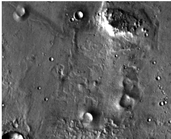
Figure 2. THEMIS base map showing lobate materials and the source constructs (pitted cones). Note cross-cutting relationships between the lobate materials within which the pitted cones are located.

Based on current mapping results, we suggest that the regional VB margin formed through the soft-sediment deformation related to seismicity [8] (and not by an ocean shoreline [ e.g. , Parker et al., 1989]). We attribute characteristic landforms to shoaling effects of a seismic wave and the detachment and southward movement of surficial units. This hypothesis implicates major variation in the near subsurface (within the uppermost tens of meters), perhaps due to grain size, lithification, and/or water or ice content. Older surfaces may indicate higher stands of subsurface volatiles and/or different layers of liquefied lowland materials. We speculate that the source of the seismic energy was one or more lowland impacts, whereby lowland material was conducive to wave propagation.