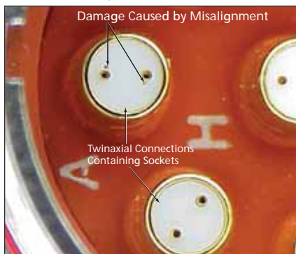
Figure 1. The Dielectric Material Near Sockets is damaged in two of the connectors shown here, because of an attempt to mate them with connectors containing pins that were misaligned with the sockets.

The tool (see Figure 2) would consist mainly of a transparent disk with alignment clocking tabs that can be fitted