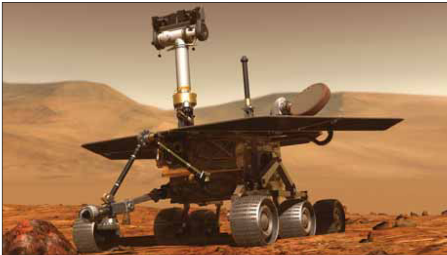
Artistic Rendition of MER.

Each VTT update takes about 50 seconds. VTT has helped to make it possible to approach a target over a 10-m traverse and place an instrument on the target during a single sol, whereas previously, such approach and placement took 3 sols. Alternatively, VTT can be used to simply image a target as the rover passes it. VTT can be used in conjunction with any combination of blind driving, autonomous navigation with hazard avoidance, and/or visual odometry.