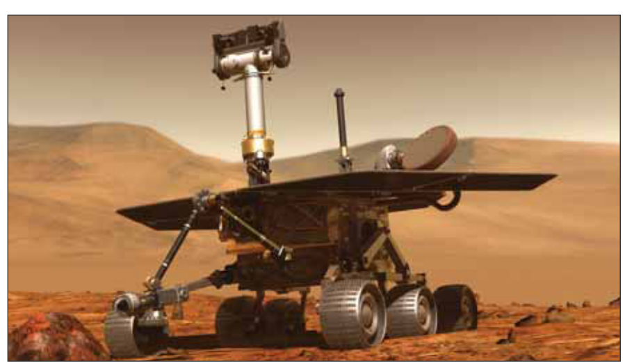
Artistic Rendition of MER

Each VTT update takes about 50 seconds. VTT has helped to make it possible to approach a target over a 10-m traverse and place an instrument on the target during a single sol, whereas previously, such approach and placement took 3 sols. Alternatively, VTT can be used to simply image a target as the rover passes it. VTT can be used in conjunction with any combination of blind driving, autonomous navigation with hazard avoidance, and/or visual odometry.