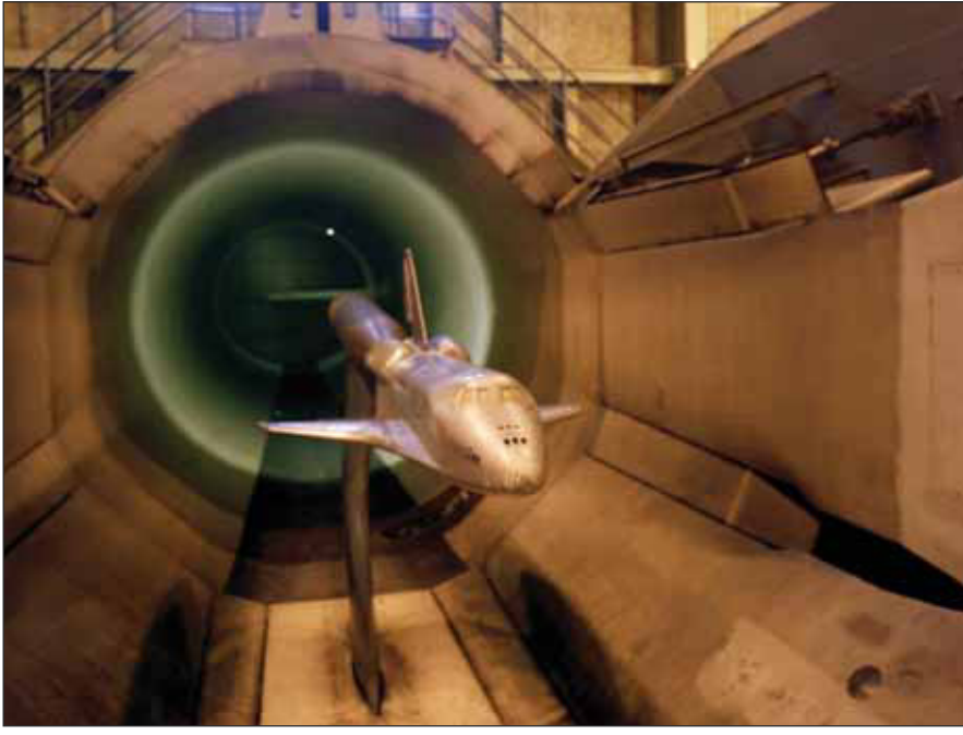
Space Shuttle Model in wind tunnel tests.

along a specific trajectory. Boundarylayer-transition criteria used in the BLT Prediction Tool were developed from ground-based measurements to account for effects of both protuberances and cavities, and have been calibrated against flight data. Version 1 of this BLT prediction tool was developed in time for the first Return-to-Flight mission STS-114.