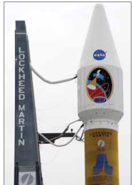
Mars Reconnaissance Orbiter on the launch pad.