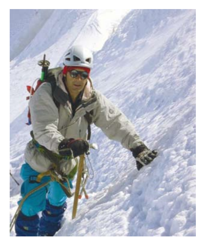
Aspen's insulating aerogels have been incorporated into extreme weather gear, where they are prized for both their light weight and extreme insulating performance.

Cryogel^TM, Spaceloft^TM, and Pyrogel^TM are trademarks of Aspen Aerogels Inc.