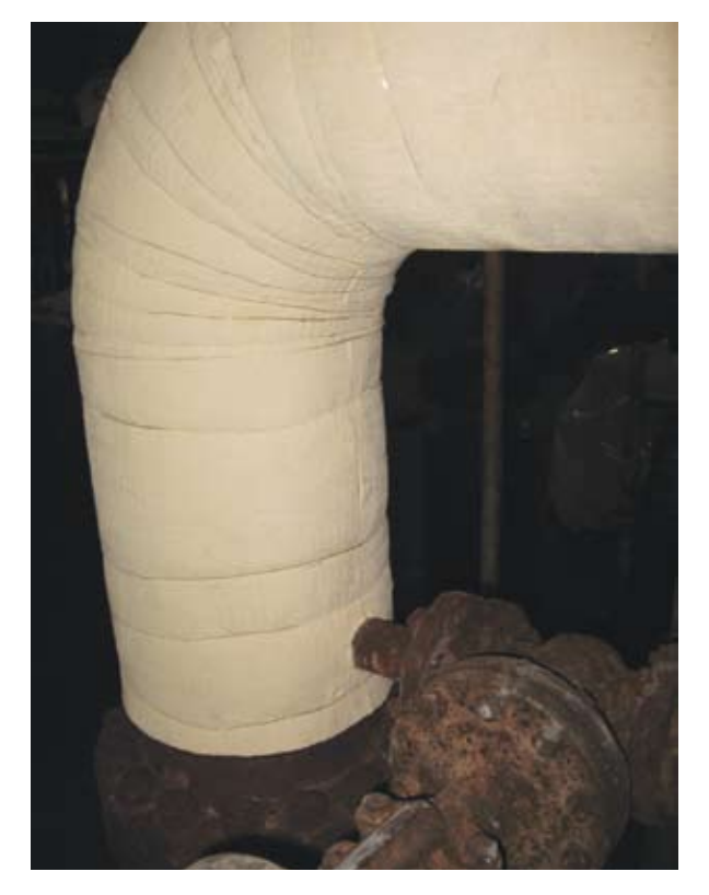
Flexible insulating blankets come in a variety of shapes and sizes, lending themselves to many different applications.

ease of use—make it an ideal thermal protection for cryogenic applications.