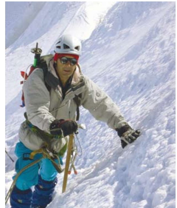
Aspen's insulating aerogels have been incorporated into extreme weather gear, where they are prized for both their light weight and extreme insulating performance.

Cryogel™, Spaceloft™, and Pyrogel™ are trademarks of Aspen Aerogels Inc.