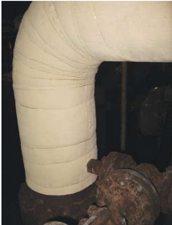
Flexible insulating blankets come in a variety of shapes and sizes, lending themselves to many different applications.

ease of use—make it an ideal thermal protection for cryogenic applications.