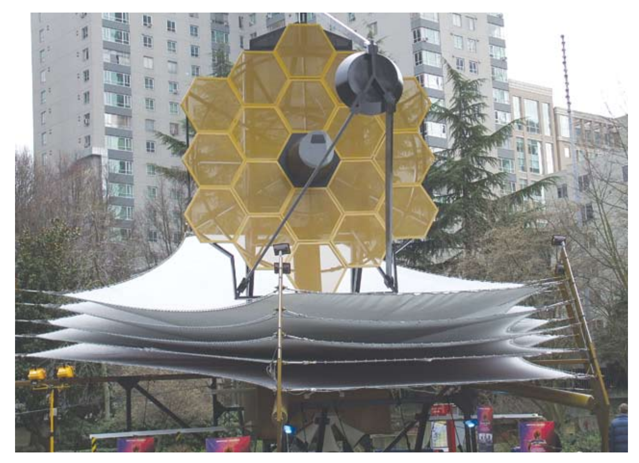
After adopting SpaceWire in 2000, NASA scientists and developers improved the network version of SpaceWire for the James Webb Space Telescope (shown here as a scale model).

board. BAE Systems sought consultation from Goddard innovators to build a new ASIC incorporating the new SpaceWire implementation.