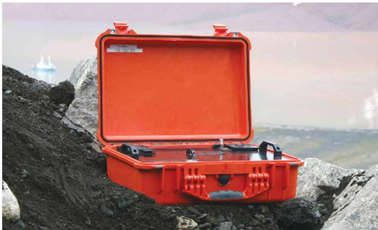
inXitu's portable rock and mineral analysis device was tested at the Mars Analog site in Spitsbergen, Norway.

inXitu's Terra product is the first truly portable XRD/XRF system designed specifically for rock and mineral analysis. XRD is the most definitive technique to accurately determine the mineralogical composition of rocks and soils. Phase identification is obtained by comparing the diffraction signature of a sample with a database of XRD mineral patterns. The addition of XRF informs on the nature of the chemical elements in the