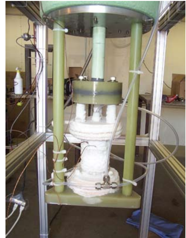
The quick-disconnect valve is shown here undergoing cryogenic testing as part of the Phase II SBIR contract with Johnson Space Center.