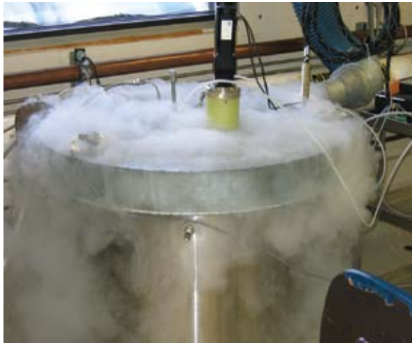
A 4-inch valve undergoing cryogenic testing in a tank as part of the SBIR work with Marshall Space Flight Center.

for VOST valve application in future spaceport systems, advanced cryocoolers, launch vehicles, and high-pressure flow-control valves.