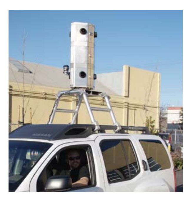
The vehicle-mounted calibrated camera array is used to collect highly accurate and detailed data at the street level.

image can be accurately located, measured, or modeled using points, lines, or polygons. This data mine can be accessed through a Web-based interface where they can identify, view, and extract information as desired. The comprehensive field-of-view in the imaging system leaves no detail undocumented, allowing visualization of everything from overhead power lines and multistory buildings, to underlying road and curb features.