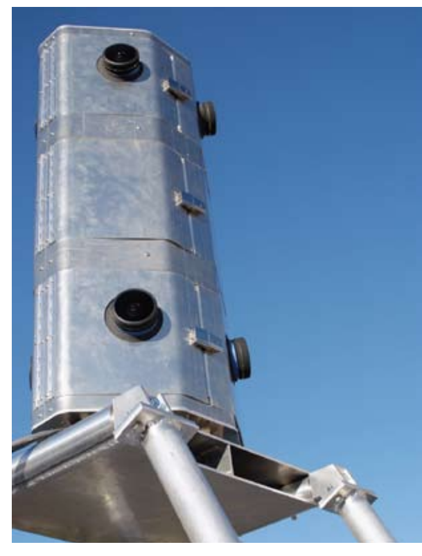
3-D data generation software and algorithms licensed by earthmine are currently utilized as a part of NASA's Mars Exploration Program. Wide-angle stereo cameras are mounted on NASA's twin robot geologists, the Mars Exploration Rovers, like those seen here on earthmine's vehicle-mounted array.

earthmine inc., a street-level 3-D mapping company founded in 2006 and headquartered in Berkeley, California, licensed 3-D data-generation software and algorithms created by NASA's Jet Propulsion Laboratory (JPL) for the MERs from the California Institute of