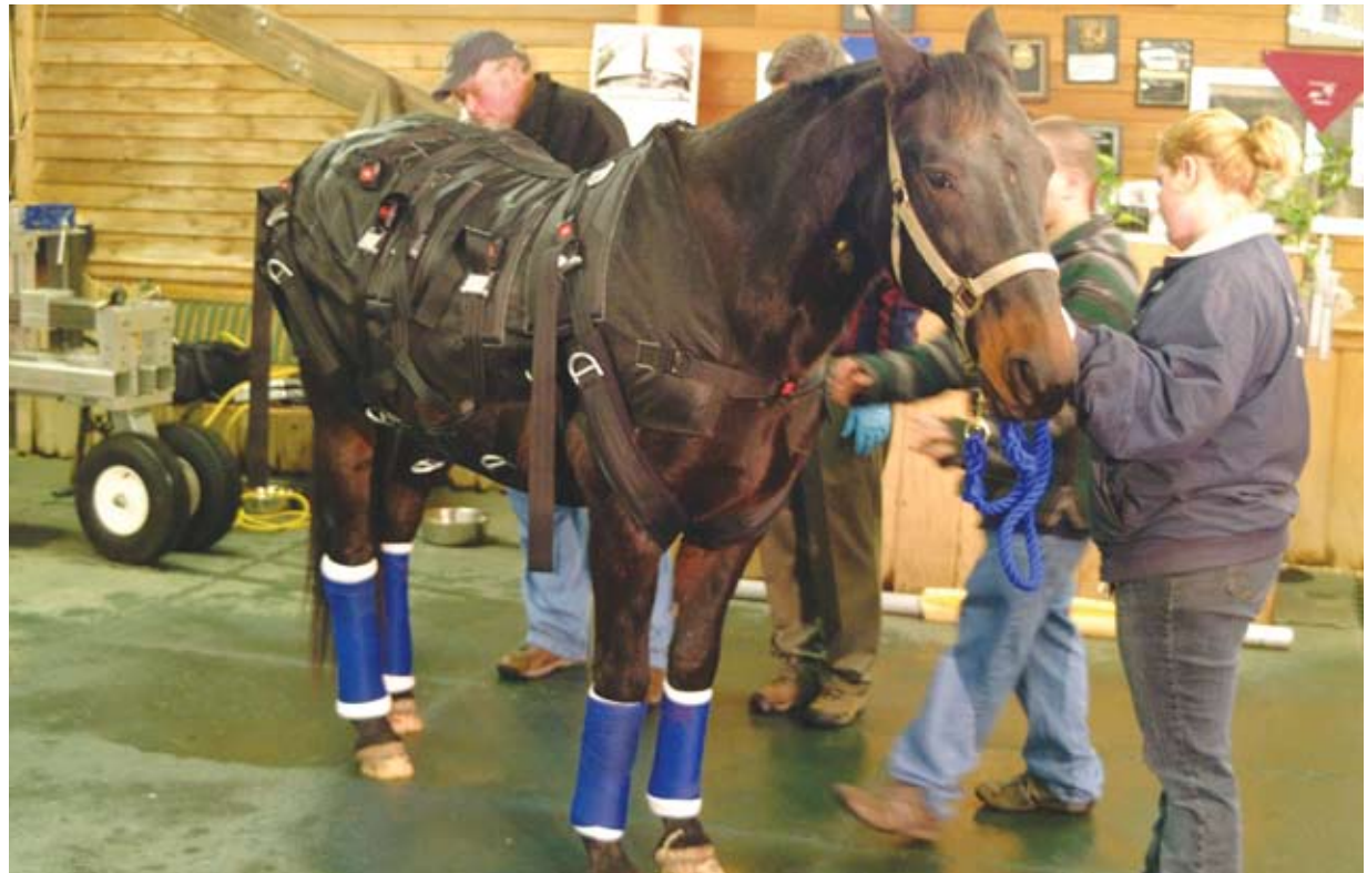
An equine patient is fitted with a specialized, flexible harness that supports the torso.

Enduro further developed the adjustable patient harness system, introducing S.A.M. in March 2003. The pelvic harness comes in various sizes and is padded with NASA-developed temper foam for comfort. The S.A.M. is