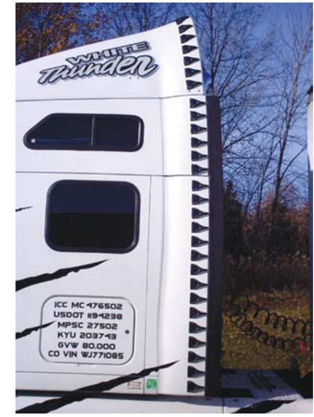
Airtabs create controlled, counter-rotating vortices to bridge the gap between tractor and trailer or control airflow past the rear of the vehicle.

Today's trailers, on the other hand, are little changed from the last few decades. For livestock haulers, a key factor is that individual farmers have been the predominant owners of trailers, and these owners are difficult to convince about the costs of redesign versus the savings of superior aerodynamics. However, more and more livestock trailers are sporting boat-tail designs that ease the flow of air past the end of the trailer and minimize the low-pressure wake. Conventional trailer manufacturers have resisted change more so than others, in part because the aft end of such a trailer needs to be easy to manipulate at loading docks, where the optimal shape for superior aerodynamics—the boat tail—is impractical.