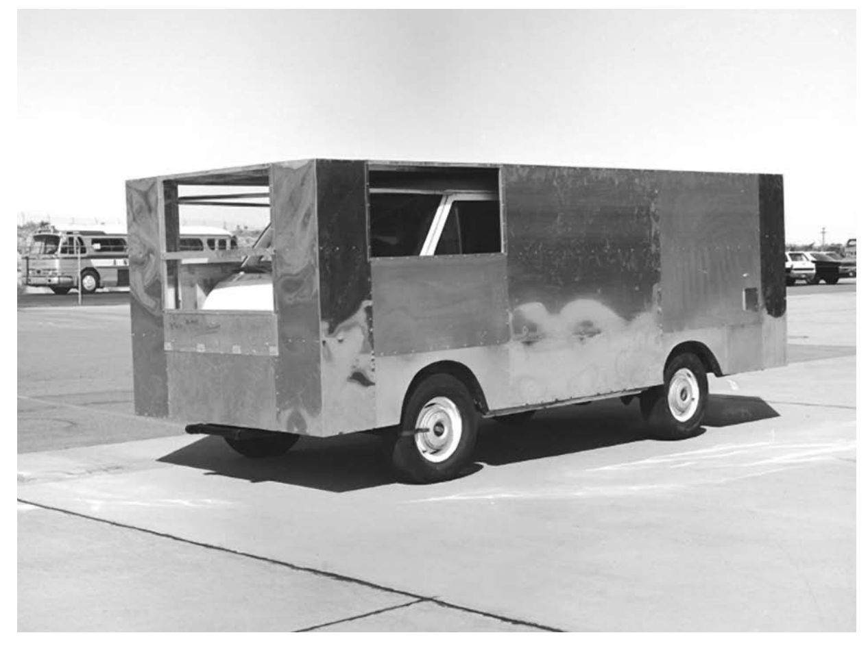
Dryden engineers modified a retired delivery van to test aerodynamic drag, first boxing the van with aluminum sheets at 90-degree angles, and then rounding the sides and fashioning a boat-tail rear.

Bicyclists, motorcyclists, and even pedestrians feel a push and pull of air as large trucks pass. The larger a vehicle is and the faster it moves, the more air it pushes ahead. For a large truck, this can mean a particularly large surface moving a large quantity of air at a high velocity—its blunt