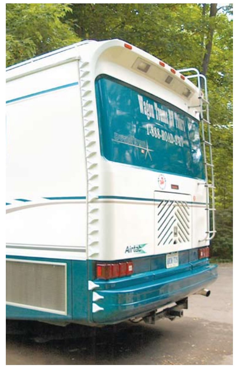
Effective on any vehicle with more than a 30-degree slope to the rear, Airtabs see many applications in addition to trucks.

Airtab® is a registered trademark of Aeroserve Technologies Ltd.