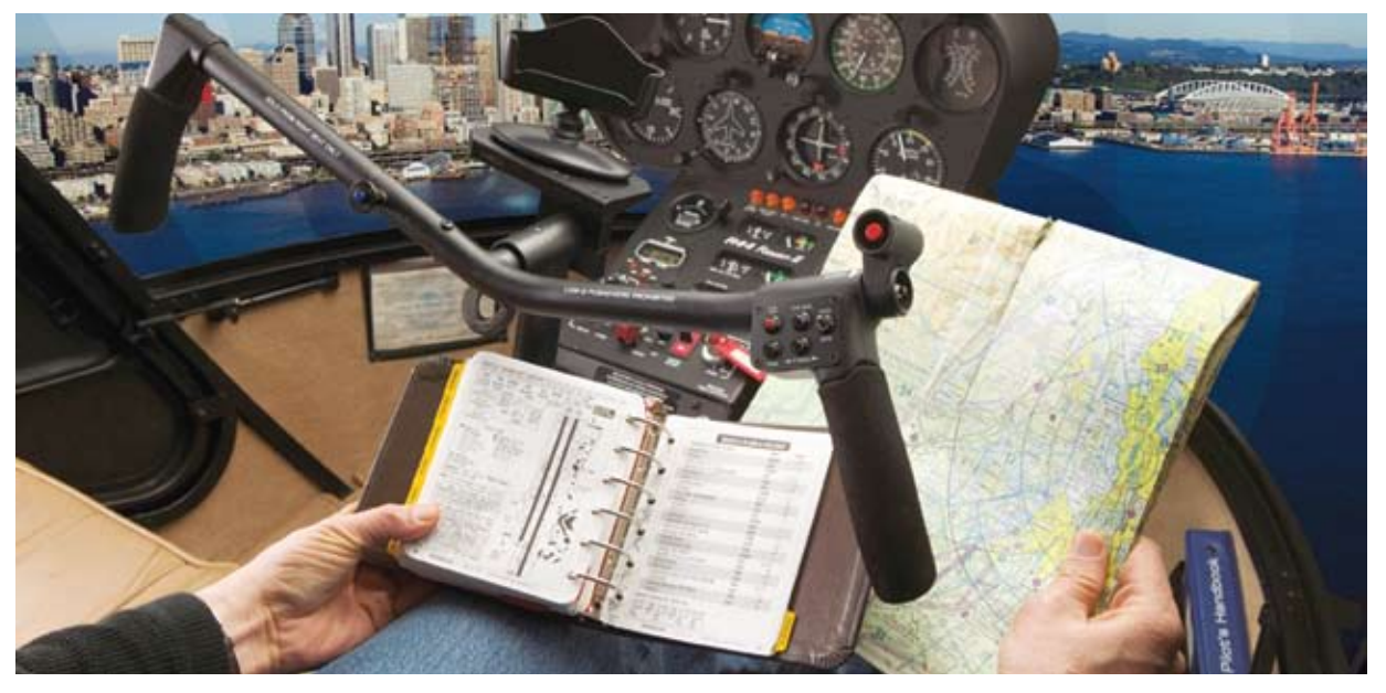
HeliSAS provides unmatched stability and ease of handling, including "hands near" operation while maintaining heading or navigation course and attitude—even during turbulent conditions.

HeliSAS<sup>TM</sup> is a trademark of Hoh Aeronautics Inc.