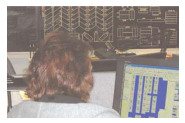
Through partnering with NASA, Knowledge-Based Systems Inc. developed several advanced technology solutions that are aiding space missions and industry.

WorkSim is a resource-constrained daily workdispatching tool that generates optimized, daily schedules. It helps agencies streamline and speed their