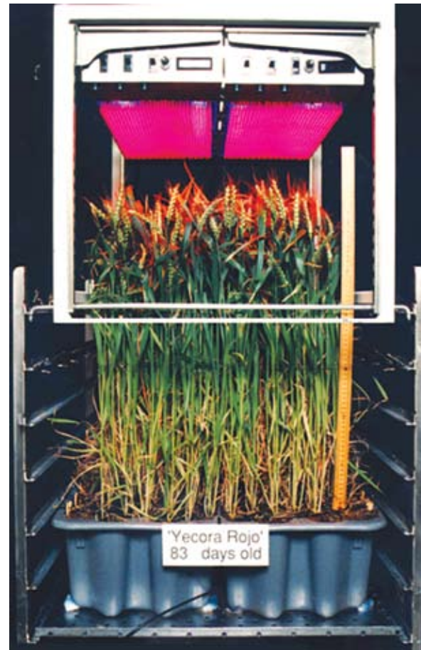
Studies have shown red LEDs are a viable light source for growing plants in space flight due to their small mass and volume, wavelength specificity, longevity, and safe operation.

QDI then used a Defense Advanced Research Projects Agency (DARPA) SBIR contract to develop the WARP 10 (Warfighter Accelerated Recovery by Photobiomodulation) unit as a full realization of its PBMT research. WARP 10, a hand-held, portable, HEALS technology originally intended for military first aid applications, received U.S. Food and Drug Administration (FDA) clearance in 2003, and a consumer version was introduced for temporary relief of minor muscle and joint pain. WARP 10 has been found to relieve arthritis, muscle spasms, and stiffness; promote relaxation of tissue; and temporarily increase local blood circulation.